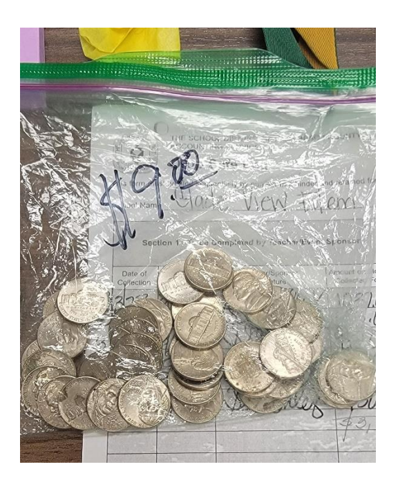
Nickels: Written Amount $9.00 Actual Count $1.85